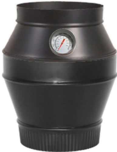
StoveCAT Model 0608-01

The StoveCAT Model 0608-01 is designed for wood stoves and furnaces with 6" exhaust piping. This model is 13" high and 8" wide. It uses a single stage 6" or 7" catalytic component from Clear Skies Unlimited treated with a Platinum Catalyst designed especially for reducing wood smoke emissions.